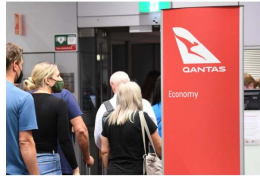
Passengers boarding a Qantas flight last week in Australia.

Israel closed its borders to foreign travelers late in 2021. The country now allows unvaccinated travelers to enter the country , but requires all tourists, regardless of vaccination status, to take a PCR test within 72 hours before flying to the country, and another upon landing in Israel, where they must quarantine for up to 24 hours until they receive a negative result.